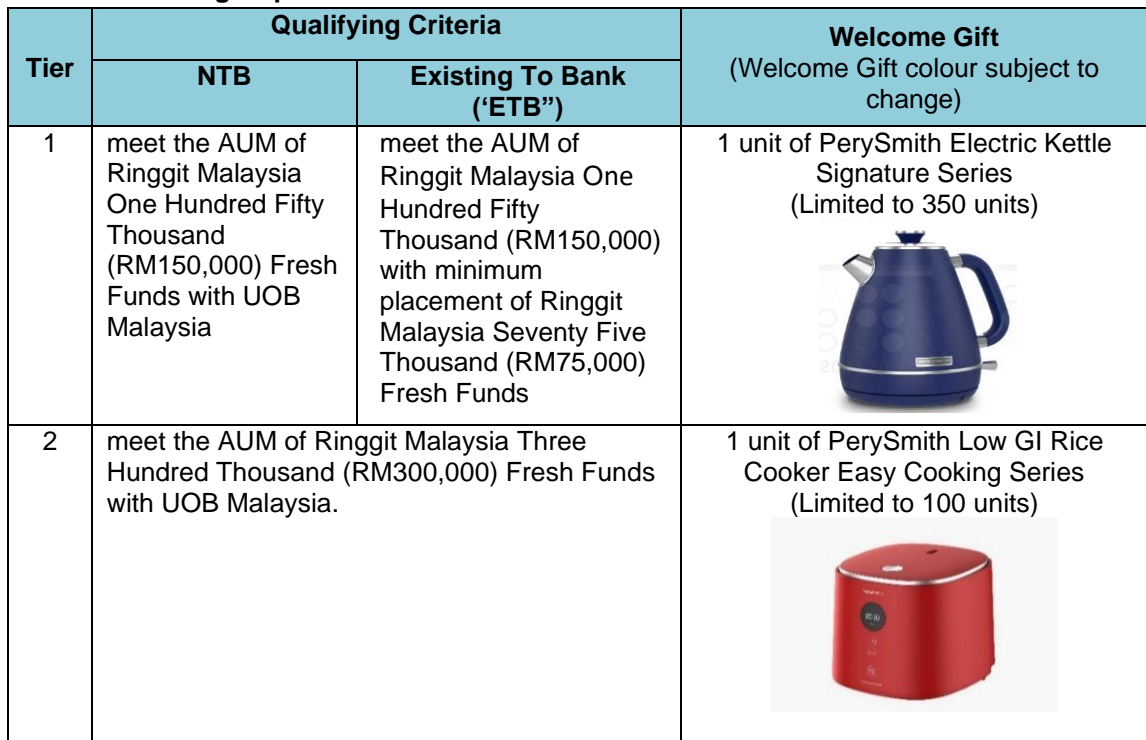
Table B – WB Sign Up