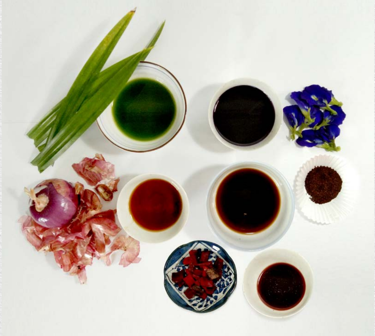
Materials for making the natural dyes: Pandan Leaves, Red Onion, Beetroot, Blue Pea Flowers and Black Coffee Powder