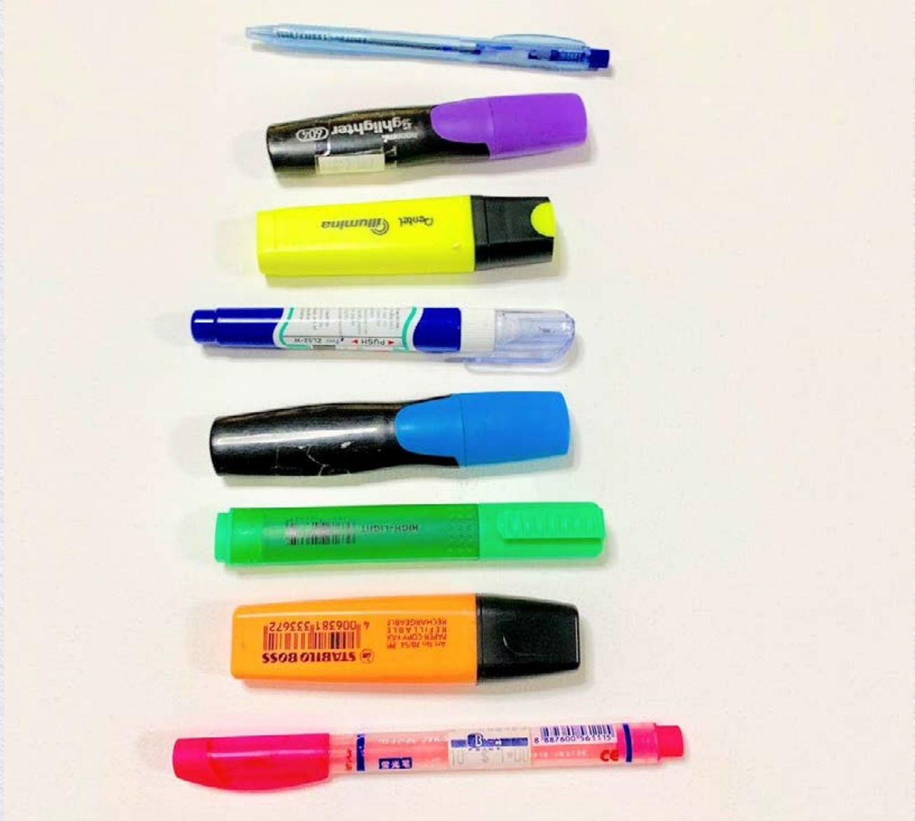
Materials: Drawing Paper, Highlighters, Ballpoint Pens and Correction Fluid